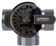
263028 • 3-way 2" x 2½" PVC 263037 • 3-way 1½" x 2" PVC