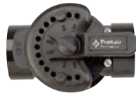
263027 • 2-way 2" x 2½" CPVC 263036 • 2-way 1½" x 2" CPVC