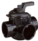
263026 • 3-way 2" x 2½" CPVC 263035 • 3-way 1½" x 2" CPVC

Pentair valves offer dependable, lubrication-free performance for less. Engineered for long life, they outperform other manufacturers' higher priced valves. Ask your sales representative for pricing.