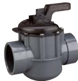
263029 • 2-way 2" x 2½" PVC 263038 • 2-way 1½" x 2" PVC